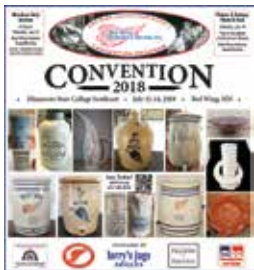
Last year's Convention Program

As you'll see on the 2019 Convention Registration form that accompanies this issue of the RWCS Newsletter , you can now purchase your ticket for the Pottery Museum's "Wine-ing for Red Wing" fundraiser when registering for Convention! If you buy your ticket along with your Convention registration, a voucher for the event will print out along with your Convention name badge that you'll pick up at Convention. Simply turn in that voucher at the check-in table when you arrive at the museum. Take a look at the back page of the registration form for all the details.