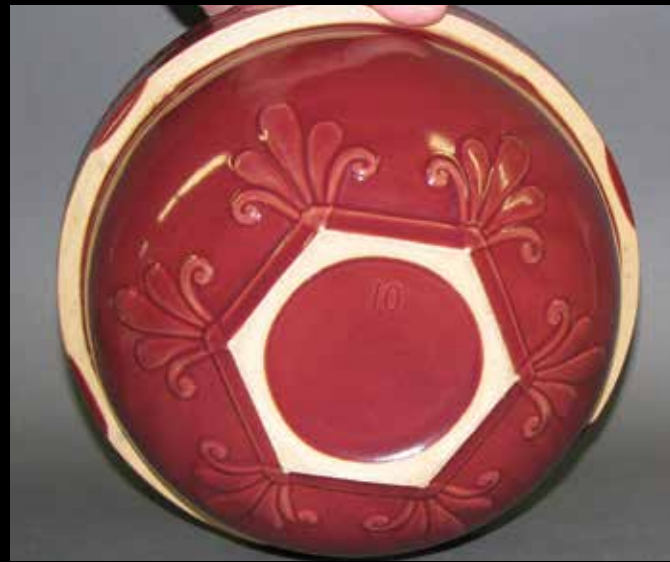
Above: This 10 inch Hexagon bowl is one of the only known colored in Red Wing's Mulberry glaze.