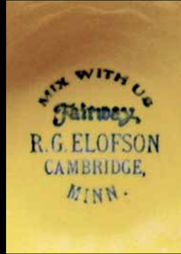
Above: The only ad currently known to appear in a Hexagon bowl.

observations I've made over the years that pertain to Hexagon bowl colors: