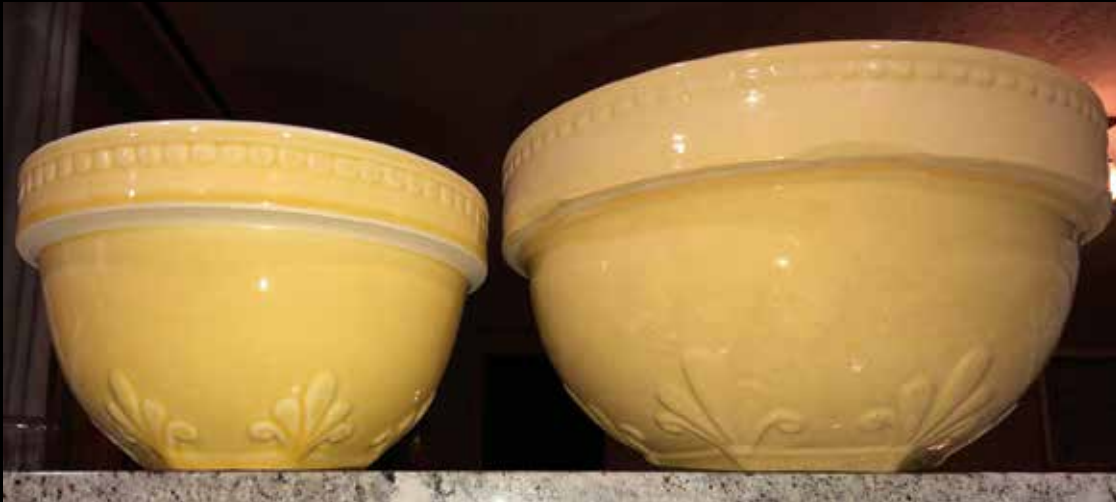
Above: Although they appear to be the same color, a close inspection of the photo shows the difference between the yellow bowl on the left and the Saffron Ware bowl on the right.