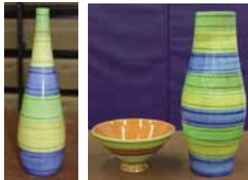
Chromoline prices remain strong! From left to right: #682 vase (mint), $450; #675 bowl (chip), $100; #687 vase (mint), $650.