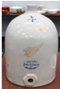
This killer 4 gallon wing beehive threshing jug with "Ski" oval (flake & chip) sold for $1,200.