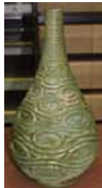
Standing 20" tall, this M3016 Decorator Line vase (mint) was a good buy at $400.