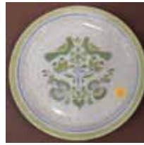
A test plate with green and blue Turtle Dove pattern on a beige fleck Hotel & Restaurant plate sold for $340. Glaze codes "315-238-400" were on the back.