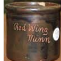
Measuring only 3.25" tall, the lunch hour piece (chips) above with "Red Wing, Minn." on one side and "Ellen" on the other sold for $1,050.