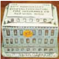
This hard-to-find advertising piece made in 1939 to commemorate the 25th anniversary of Citizen's Fund Mutual Fire Insurance Co. sold for $375.