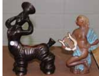
At only $275, this stunning #806 Nokomis vase was a great buy.