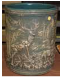
Bottom-signed with the Red Wing Union Stoneware ink stamp, this #107 Stag Sand Jar had an outer rim chip and sold for $450.