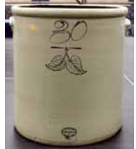
There were two 30 gal Elephant Ear transition crocks in the sale; the one above (mint) sold for $1,150 and a damaged one sold for $450.

This "Minne-ha-ha Brand" adv. crock was bottom-signed. It hammered down at a respectable $1,900 bid.