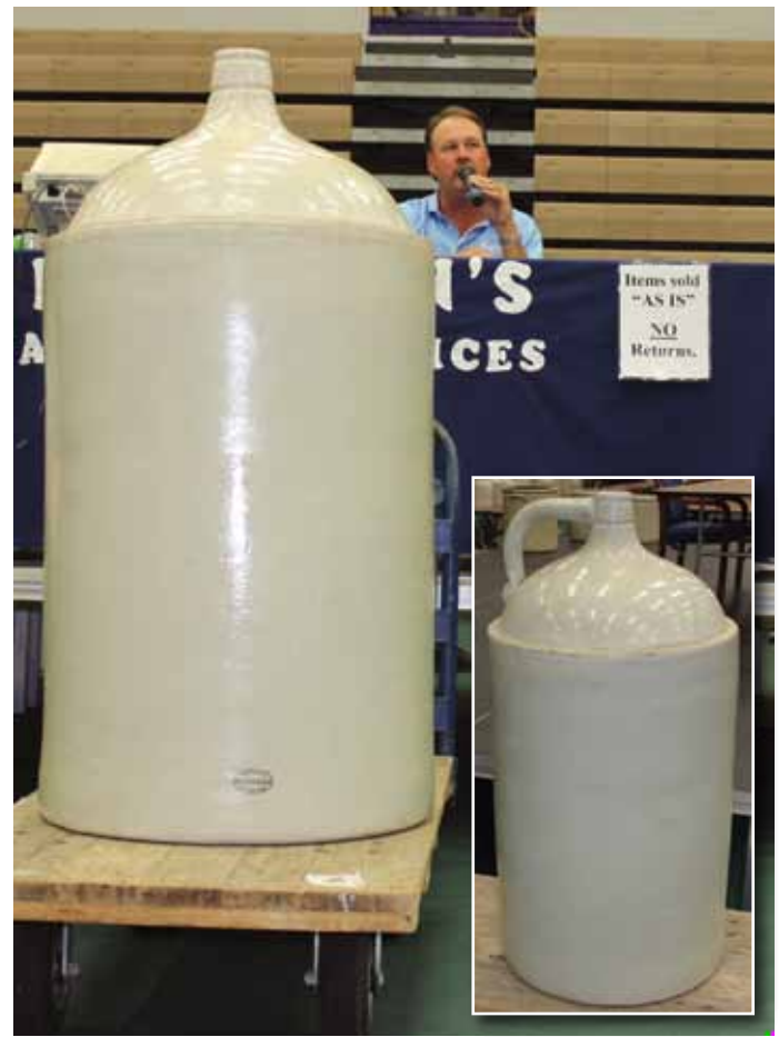
Only the second 70 gallon jug known to exist, this massive piece took top honors at the 2014 RWCS Convention Auction. Although restored, it sold for $17,000. It has a 6-foot 5-inch circumference and measures a whopping 4 feet tall, which is actually 1 inch taller than the 70 gallon jug that the Schleich Family donated to the Pottery Museum.

The only Red Wing piece known to have a triple target, this impressive 4 gal crock sold for $5,000 despite having a hairline on the back.