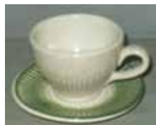
Left: Empire Shape "bell style" cup & saucer in beige fleck and green trim. Right: Empire Shape "tall style" cup & saucer in beige fleck.