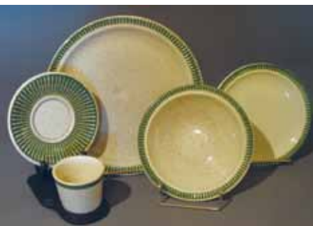
Above: Empire Shape cup & saucer, dinner plate, bowl and bread plate in beige fleck with green trim.