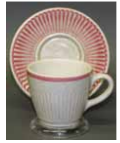
Diamond Jim cup & saucer.

Diamond Jim's was a nightclub located in Mendota Heights, Minn. – a suburb of the Twin Cities just south of the Mississippi River. There may also have been at least one location in California, according to a Red Wing collector who recalls working at a Diamond Jim's there many years ago. The artwork on Diamond Jim plates featured an antique automobile. A different auto appeared on each of the five plate sizes. The auto was dark pink and black against a white background. The entire rim of each plate (not just a trim line) was dark pink. Cups and saucers and possibly other pieces had the same dark pink rims. The antique auto motif has great