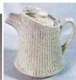
White Empire Shape creamer and beige fleck teapot (above) and orange lobster dish (below).