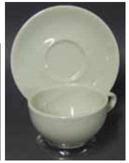
Regal Shape bowl and cup & saucer.

few Regal pieces: Plates in three sizes, Bowls in two sizes, Bouillon Cup and Cup & Saucer. This explains several previously undocumented pieces that have been found in recent years. Regal was likely produced for only a brief period before the Potteries closed in 1967. Examples that are marked have an upright green wing with a block "Red Wing" across the middle.