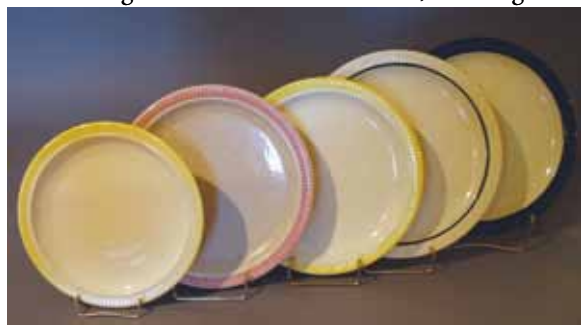
Above: Empire Shape plates with various trim colors. Below: Empire Shape sauceboat and sugar dish in beige fleck.