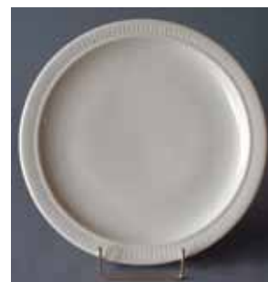
White Empire Shape dinner plate (above) and bowl (below).

All pieces were available off the shelf in either white or beige fleck. For an additional charge, a trim line could be added; available colors included blue, green, red, yellow and possibly others. Besides the two standard colors, the lobster dish was also available in orange. Some references include this lobster dish with the CeramaStone line, probably because of the orange color. But that is incorrect; it belonged to Hotel or Restaurant.