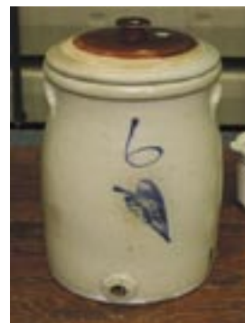
6 gallon salt glaze water cooler, chips on lid: $4,250