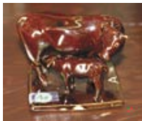
Cow & calf statue, mint: $5,250