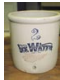
2 gallon straight-sided Ice Water cooler, base chips: $3,600