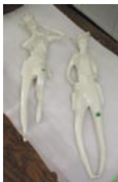
Cowboy figures designed by Charles Murphy, one mint, one with chip on hat: $4,300