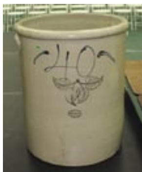
40 gallon elephant ear transition crock with Union oval, chips & front crack: $1,600