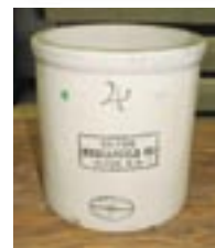
4 gallon Clyde, ND advertising crock, base chip: $1,200