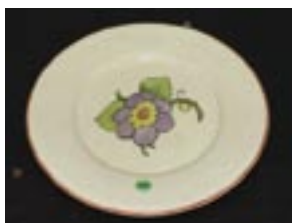
Chevron lunch hour dinner plate with "35¢" written under glaze on front, mint: $575