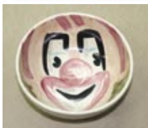
Hand-painted oven proof clown face bowl, mint: $325