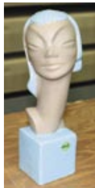
#1147 grey & turquoise englobe, mint: $950