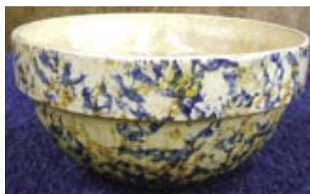
Above: The Lampert Yards Red Wing advertising bowl. Top of page: (left to right) Lampert's Cleveland, Minn. location in 1938, an undated photo showing three Lampert employees, the Northfield, Minn. location in 1938.

dealing in large quantities of lumber, it was decided that its headquarters should be moved closer to the source of supply, which was primarily in northern Minnesota and Wisconsin. So in 1900, the general office was moved to the Twin Cities.